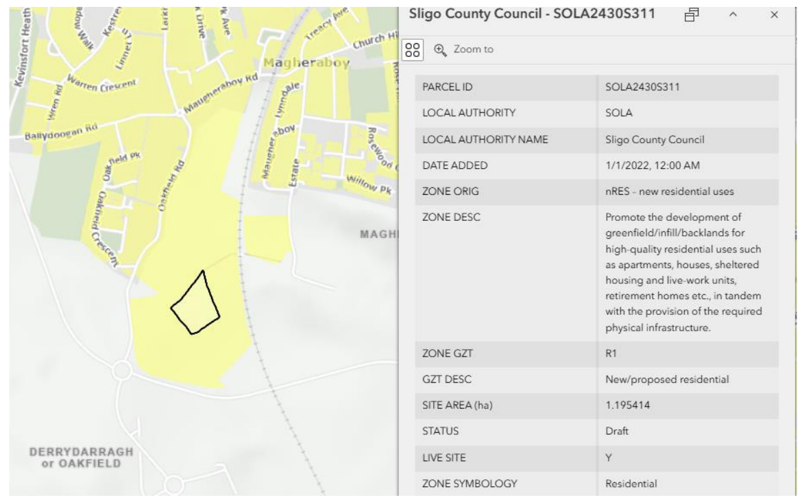
Figure 1 Subject Sites outlined in black, 'in scope' for RZLT.

identified as 'in scope' for the Residential Zoned Land Tax under portions of the Parcel ID no. SOLA2430S311, the land parcel is identified in Figure 1 below.